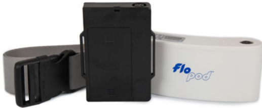
6xAA Battery Pack